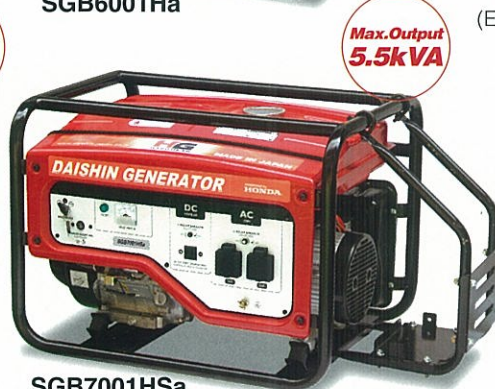
SGB7001HSa (Electric start model)