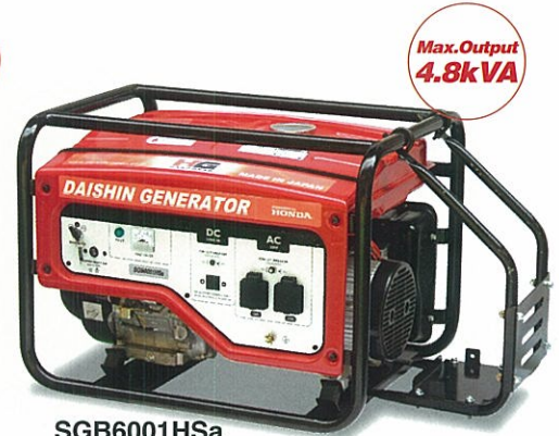
SGB6001HSa (Electric start model)