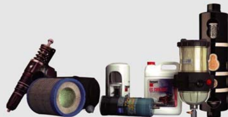
500 hours genset spare parts