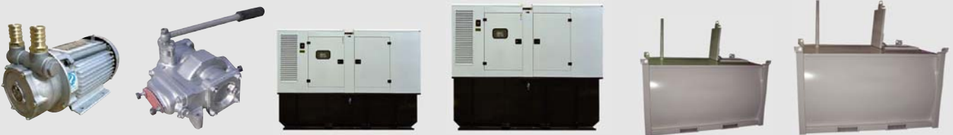
Auto filling fuel pump