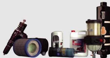
500 hours genset spare parts